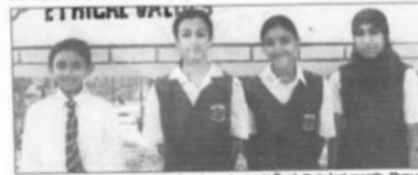
The Libra learners who won the Teachers' Society's Book Quiz last month. They are...

LIBRA Primary School has some of the most accomplished learners in the Lenasia area.